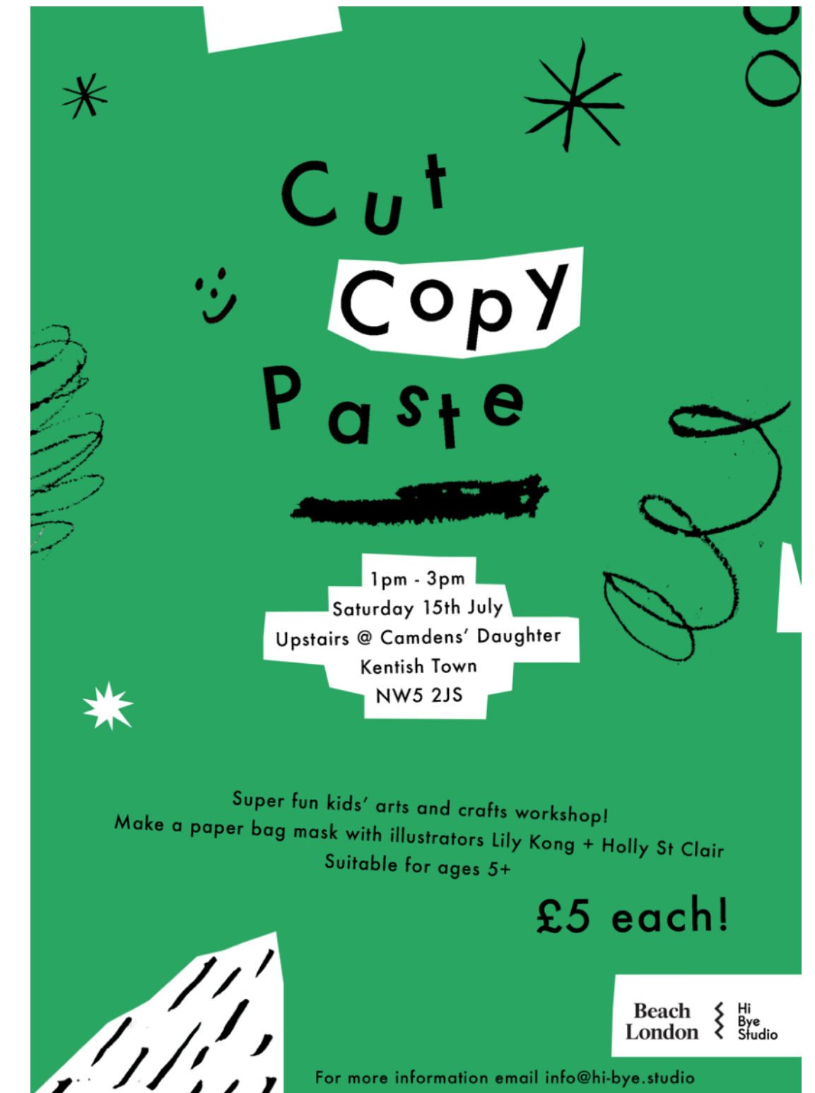
'Cut Copy Paste' Hi Bye Studio, 2017.